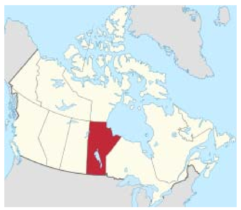
Figure 2: The Location of the Province of Manitoba within Canada.

The survey design and sampling procedures. In this study, an older migrant is defined as an individual who (i) had made a permanent move to the study area within the five-year period immediately prior to the survey, and (ii) was also 55 years of age (i.e., the 'young-old' who fall within the 'retirement transition' age cohort) or older at the time of the survey. An additional eligibility criterion is that the older migrant's place of origin is located outside the census division in which the destination community is located, thus excluding local movers from the survey. The entire sample of seniors includes 34 subjects. These respondents lived at various locations throughout the study area, although 19 were residents of Gimli and seven were residents of Winnipeg Beach.