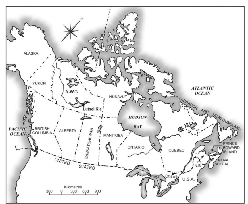
Map by Cathy Chapin, Department of Geography, Lakehead University.

LKDFN, the rural community of Łutsel K'e (previously called Snowdrift), Northwest Territories, is situated at the northwestern reaches of the Canadian Shield and boreal forest, approximately 200 km east of Yellowknife on the East Arm of Great Slave Lake (see Figure 1). Therefore there is no road linking the community to other places in the Northwest Territories: Access is either by air or water (boat in the summer or snowmobile in the winter). A road exits the community, passing the airstrip and continuing for 15 km to the landfill, the cemetery, and a small lake. The community has approximately 400 residents, most of whom are members of the LKDFN. Though the total LKDFN membership is approximately 700 individuals, approximately half of these individuals live outside of Łutsël K'e (personal communication, Chief Steven Nitah, June 11, 2008). A number of non-First Nation residents also reside full or part time in Łutsël K'e, filling many of the professional positions (e.g., teachers, nurses, and social workers) in the community. The town itself consists of approximately 150 buildings, including one store, a school, a college, a church, a bed and breakfast, a community centre, an arena, a health-care centre, a social services and healing centre, and several municipal buildings (NWT Bureau of Statistics, 2004a).