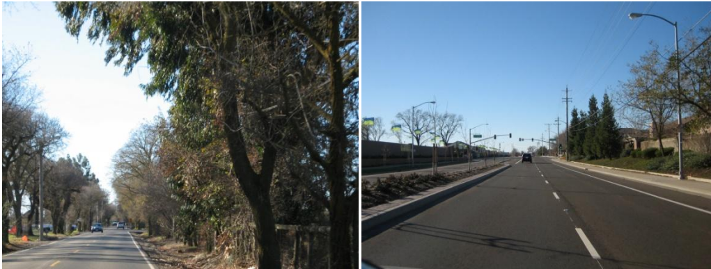
Figure 4. Rural versus "improved" roads in Elk Grove, California.

Photos by first author, taken 12/28/2006