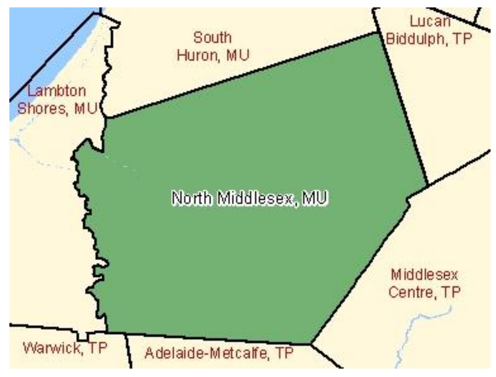
Figure 1: North Middlesex Municipality.