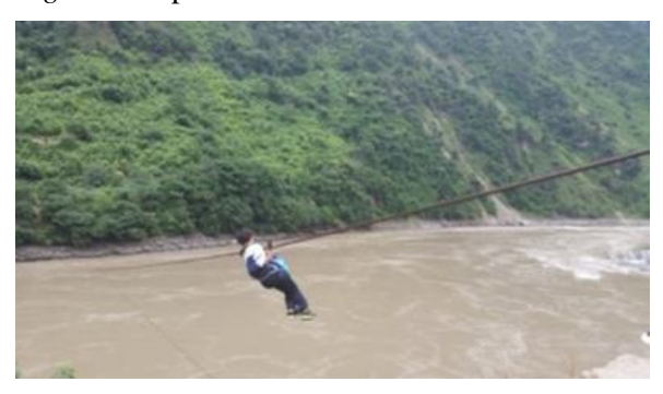
Figure 1. Zip-line.

Source: Photograph taken by Shengyu Pei, 09/28/2015.