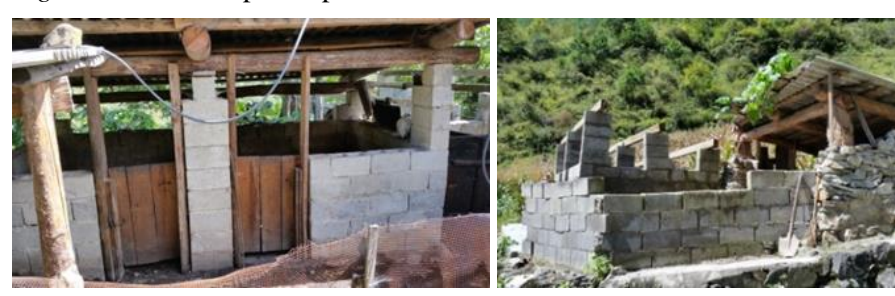
Figures 8 and 9. Separate pens.