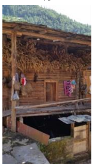
Figure 7. Type 3.

Source: Photographs taken by Shengyu Pei, 09/28/2015.