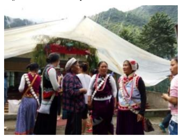
Figure 2. The Nu People.