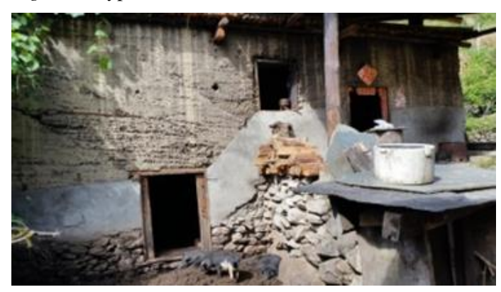
Figure 6. Type 2.

Source: Photograph taken by Shengyu Pei, 09/28/2015.