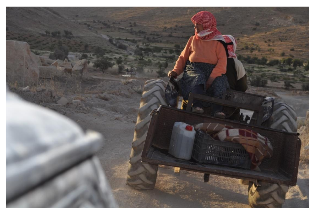
Figure 2. An elderly couple travelling the windy road into the lower highlands to work in their fruit orchard.