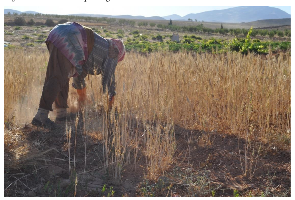
Figure 3. Woman handpicking wheat.

She concluded by saying that she now attends the university in Zahlé—a major city in the Bekaa, some 2 hours drive away—studying business, so that she will not have to harvest food when she gets older. This was a repeated theme throughout our fieldwork and profoundly resonated with us on this particular day. At the end of the final interval of picking, we saw the mother keeled over beside the canopy exhausted and sick. She managed to get herself up and went to the outdoor toilet and could be heard vomiting. She then returned to the shade of the canopy, laid on the ground and curled up in obvious discomfort. That was the conclusion of one day of wheat harvesting.