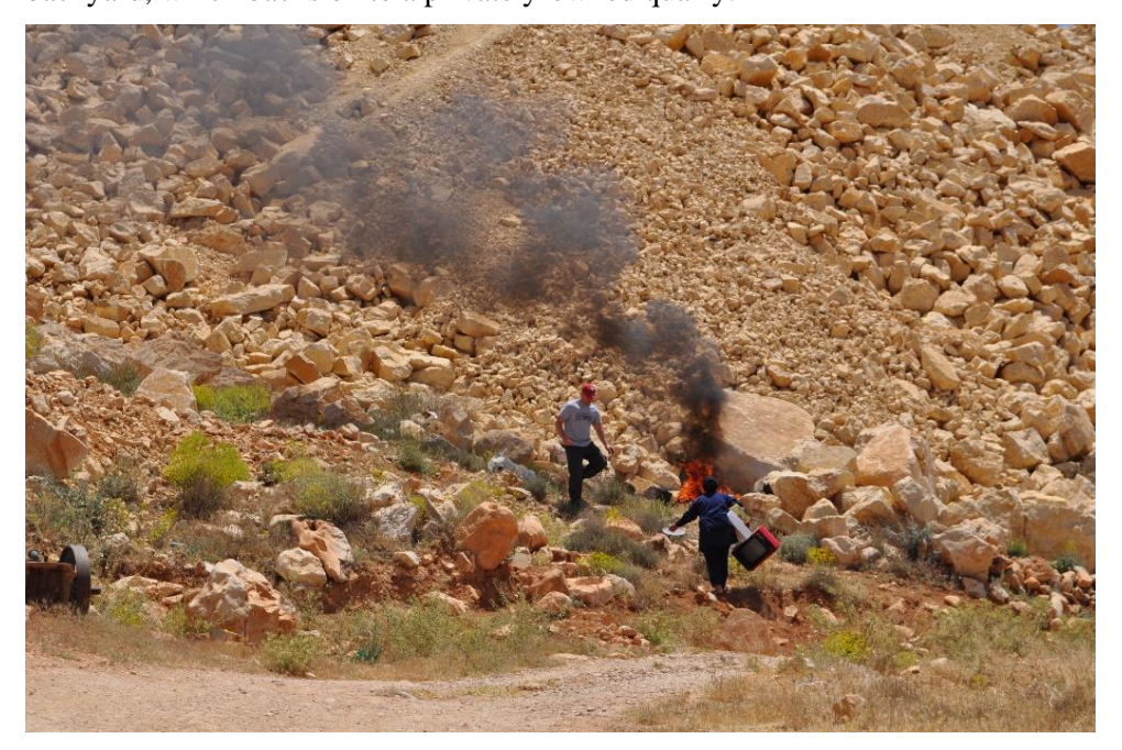
Figure 1. Burning household waste, including television set, in household backyard, which backs on to a privately-owned quarry.

The dramatization of romantic constructions of the rural only truly began to resonate with us as we engaged in fieldwork in Arsal, a community only 120 km from Beirut, yet politically, religiously, and to a certain extent economically isolated from the rest of the country. Here, where quarry and stone-cutting operations symbiotically exist with residual pastoral and agricultural practices, ecosystem bliss was difficult to fathom. Instead, one encounters dust dense air that hinders breathing at various points of the day. Quarry and stone-cutting residues, along with a defunct waste-management system, lead families to burn their refuse (see Figure 1) over underground water basins, compromising water and soil quality.